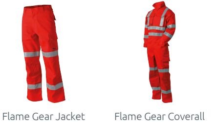
Flame Gear Jacket

Also available in the Flame Gear range :